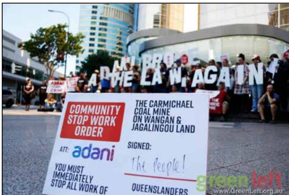
Anti-Adani protesters with a community 'Stop Work' order in Brisbane, September 13.

Adani's lawyers argued that the "water trigger" only applied if the water was used in the extraction of the coal and that the water being taken from the river will only be used to wash coal and manage dust.