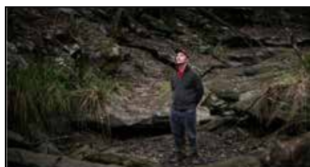
ABC, NETAU "This is definitely unnatural": Sydney coal mine ordered to repair creek with 'disappearing' water

http://www.abc.net.au/news/2018-09-17/sydney-coal-mine-ordered-to-repair-cracked-creek/10253148