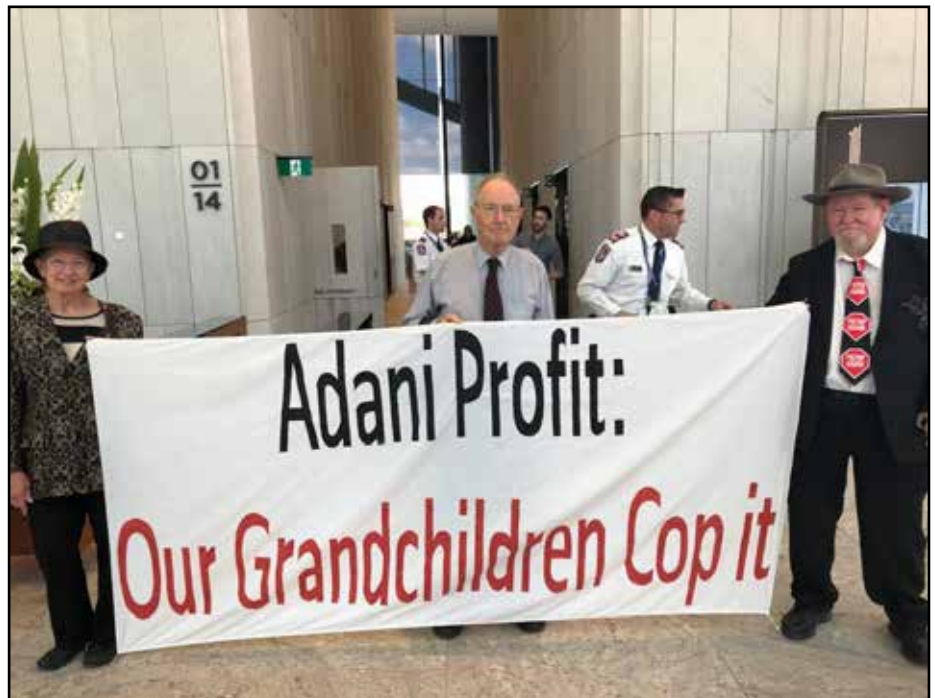
Anti-Adani grandparents demand a Stop Work Order in Brisbane last Friday, while the prosecution and investigations on Adani proceed.