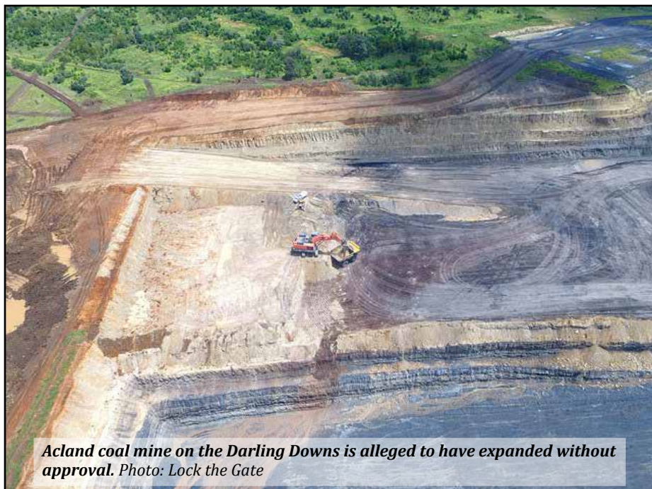
Acland coal mine on the Darling Downs is alleged to have expanded without approval.

The company allegedly expanded "mining activities into ... proposed pits which are within the mining lease area granted for the mine but outside of the mine pit footprint for which NAC sought and obtained approval", according to a legal brief prepared by the Environmental Defenders Office for the Oakey Coal Action Alliance. "NAC has continued to mine outside the areas approved ... causing envi-