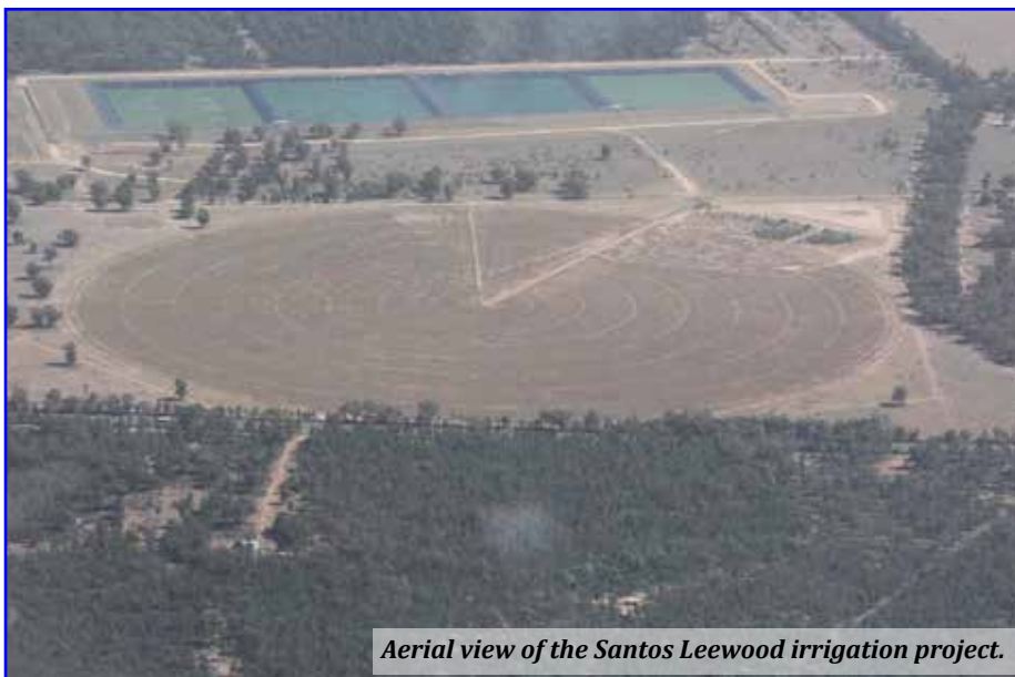
Aerial view of the Santos Leewood irrigation project.