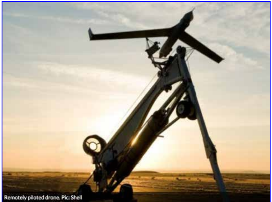
Remotely piloted drone.