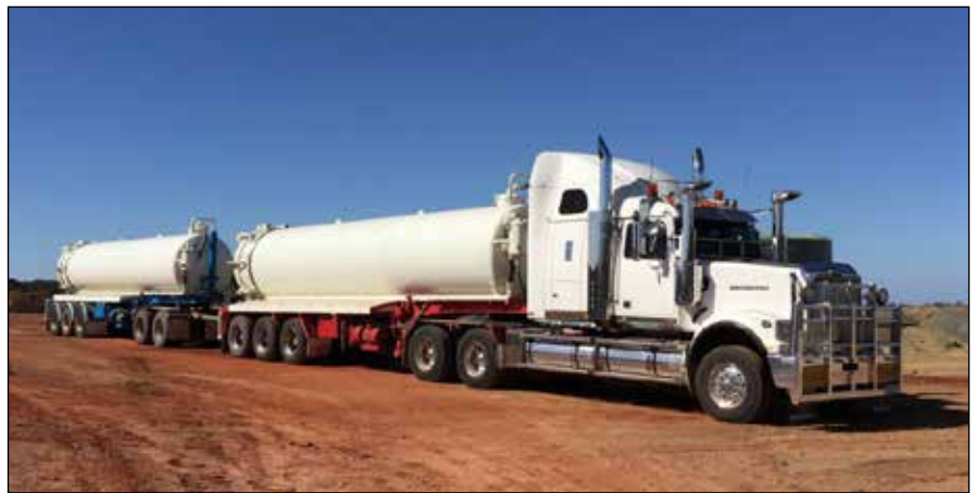
NuGrow’s Kogan waste recycling facility near Dalby accepts drill mud and fluid waste produced during CSG exploration and production, as well as effluent and food waste from workers’ camps. These are recycled into land additives or compost.

However, a hazardous waste report queries how salt-based hazards are managed in Queensland, and says there is potential to detrimentally impact land and groundwater in the vicinity of waste management facilities.