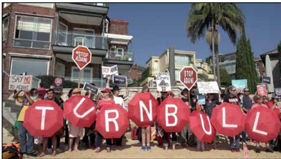
Anti-Adani protesters had a beach party at Lady Martin's Beach, close to PM Malcolm Turnbull's home, to deliver a message: no taxpayer-funded loans for Adani. The PM did not emerge, but may have looked out the window.

Adani will bankroll the jobs of local government staff tasked with assessing activities around its Queensland mine proposal — a deal anti-corruption campaigners say raises "serious