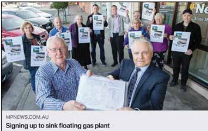
MPNEWS.COM.AU Signing up to sink floating gas plant