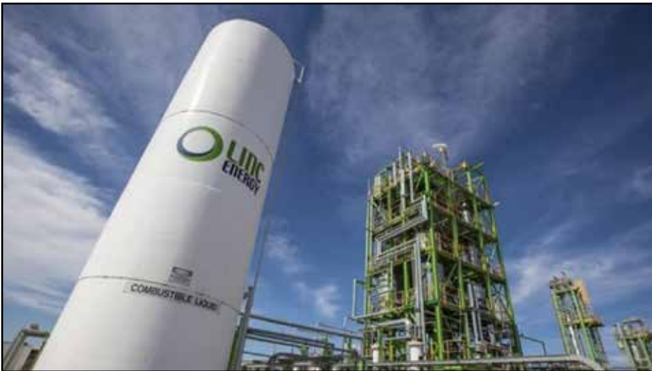
The Linc Energy site will cost the taxpayer $80 million to clean up. By going into liquidation, the company has avoided responsibility for the costs and is unlikely to pay its $4.5 million in fines.

was asked to consider a compensation order.