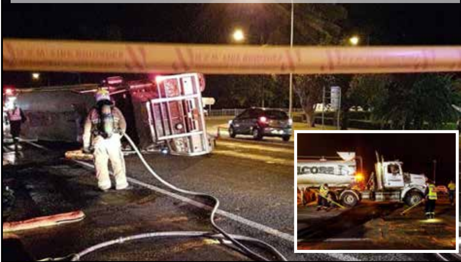
Hazmat crews clean up after Santos contractor Namoi Wastecorp's tanker rolled on a Narrabri Street.

The potential hazards of carting CSG wastewater by road were illustrated last week when Santos contractor Namoi Wastecorp rolled a truck in Narrabri.