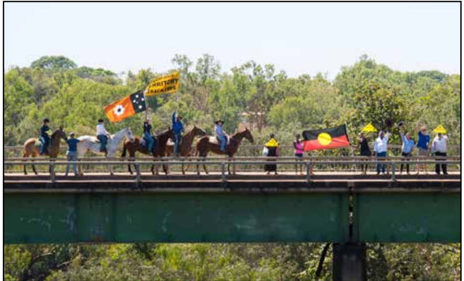
The Convoy for Country passing through Katherine enroute to the NT Labor Conference. Pastoralists and Traditional Owners stand united with communities in the frack zone to deliver their message to the Chief Minister: This is just the beginning. We will protect our water, homelands and communities from a fracked future!