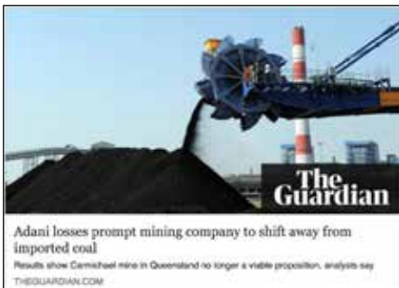
Adani losses prompt mining company to shift away from imported coal Results show Carmichael mine in Queensland no longer a viable proposition, analysts say THEGUARDIAN.COM