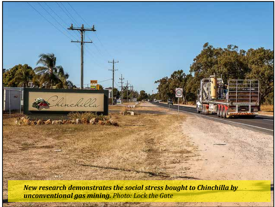
New research demonstrates the social stress bought to Chinchilla by unconventional gas mining.

From 2012, I led a team analysing trends in key social and economic indicators over the past 15 years in Queensland's largely agricultural Darling Downs, where over A$20 billion has been invested in coal seam