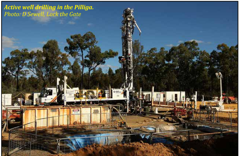
Active well drilling in the Pilliga.