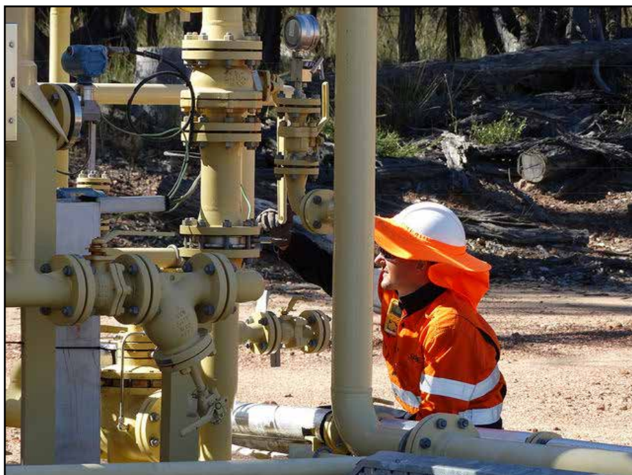
A gas worker in the Darling Downs.

"The study was methodologically poor: the inclusion/exclusion criteria for selected reports were not disclosed; there was no participatory component to set terms of reference; with regard to the clinical data, it was unclear whether comprehensive patient histories were recorded and blood tests and/or imaging conducted on patients